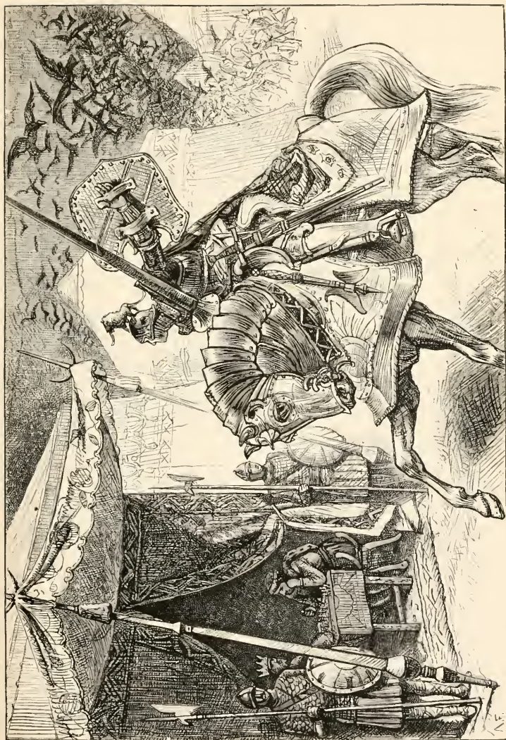
The Army of Ravens.